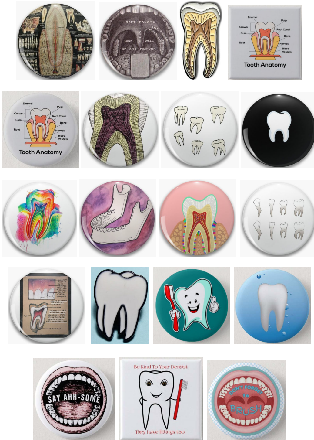
Figure 10: Faleristic selection of thematic badges dedicated to the anatomy of human teeth

Figure 10 shows a small selection of thematic badges dedicated to dentistry - 25 copies [28-30].