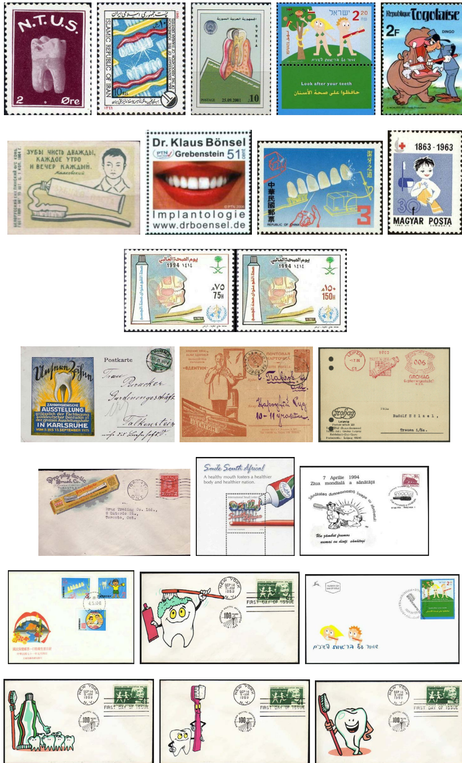
Figure. 7: Oral hygiene and dental care products, reflecting philately

Also, there are numerous philatelic materials dedicated to international congresses of dentists and national dental as-