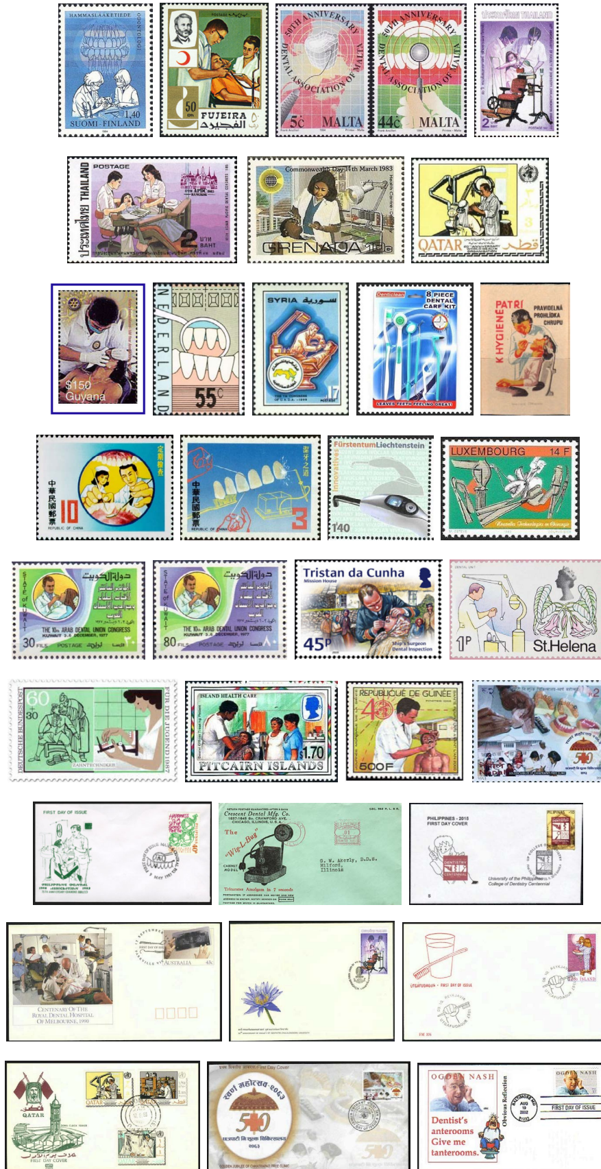
Figure 6: Modern dental equipment and instruments, reflecting philately

The following, Figure 7, presents a number of products for dental care and oral hygiene, such as: dental floss, toothbrushes and toothpaste, of different models, reflecting philately products [5-11, 13, 14, 20, 25].