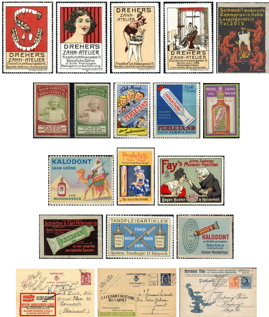
Figure 2: Non-postal advertising stamps dedicated to dentistry

cards were very popular in the 9th and early 20th centuries, especially in Europe and the USA and, subsequently, in other countries of the world. These materials are shown in Fig. 2 [10, 15, 17, 20, 26, 27].