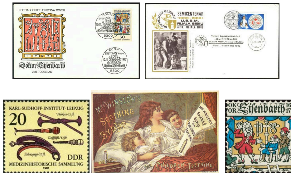
Figure 5: Philatelic materials dedicated to the history of dentistry

In Fig. 5, presents a selection of philatelic materials that are dedicated to dentistry of past centuries - medical instruments, scenes of dental care, dental services offered [6-11].