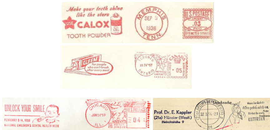
Figure 9: Special postmarks dedicated to dentistry

The anatomy of human teeth, both in the upper and lower jaws, as well as dental drawings and scenes, are presented in collectible miniatures of such a popular type of collecting as