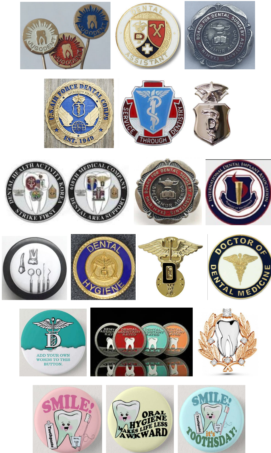
Figure 11: A selection of thematic badges dedicated to dentistry