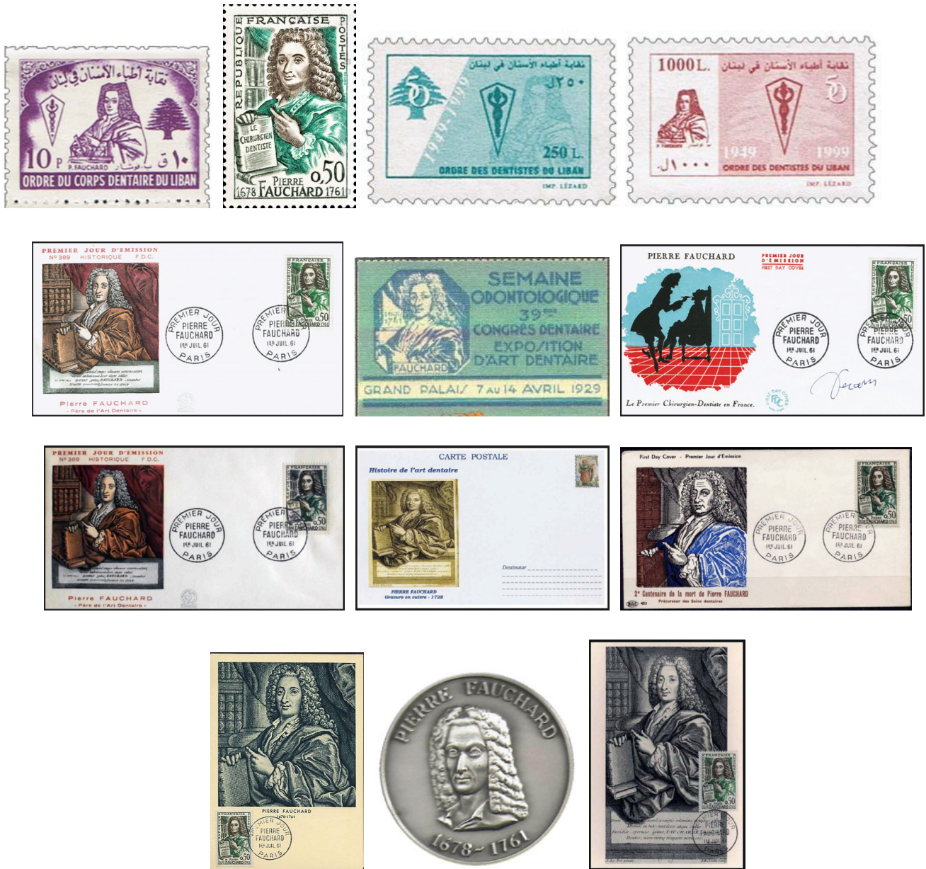
Figure 3: Collection materials dedicated to Pierre Fauhard

Speaking about dentistry and its history, it is impossible not to remember the Christian saints, patrons of dentistry, Saint Apollonia [4, 7-11, 21]. Philatelic materials (postage stamps,