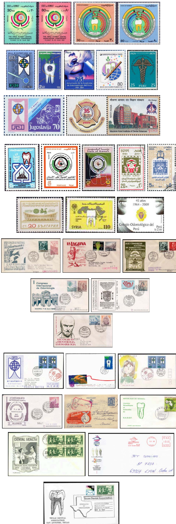
Figure 8: Teeth, their preventive examinations and treatment, issues of oral hygiene, as reflected in philately means