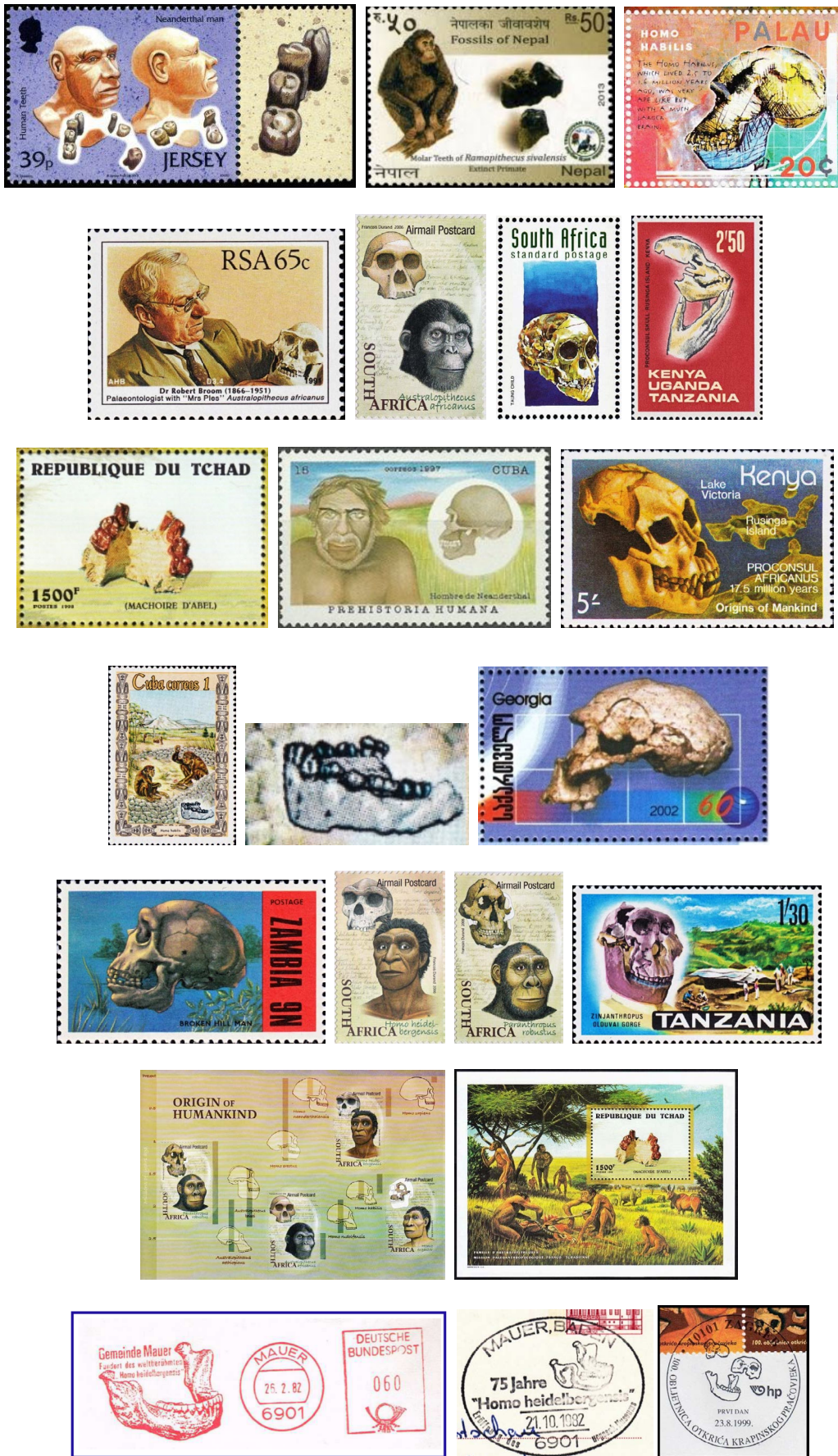
Figure 1: Philatelic materials dedicated to the study of teeth in paleontology and archeology