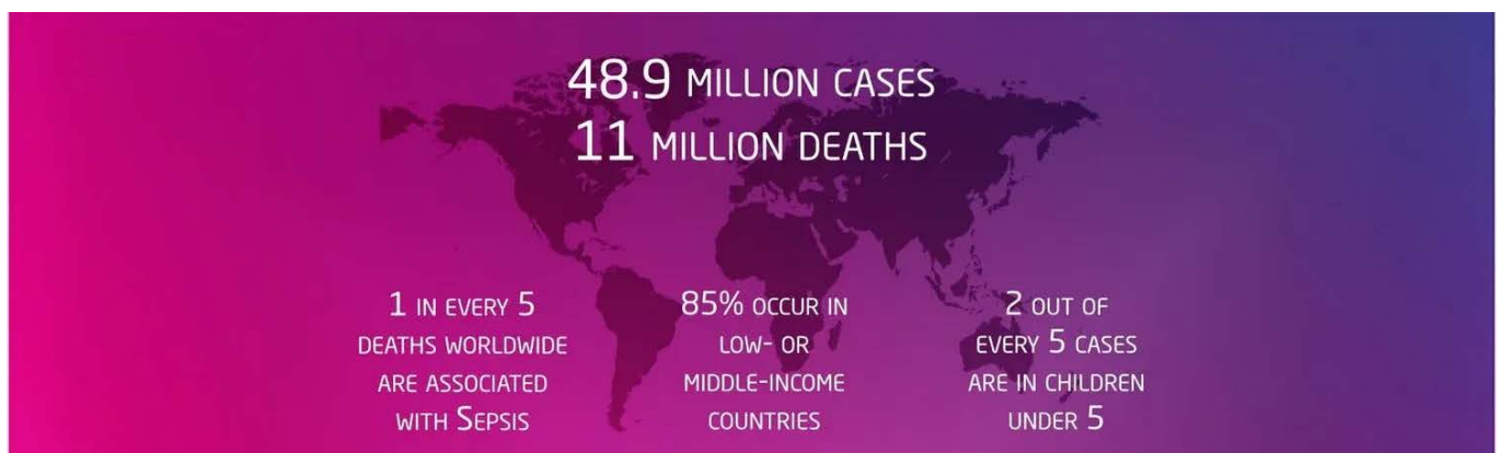
Figure 1: Worldwide Sepsis Statistics.

improving patient outcomes and reducing the high mortality rates associated with sepsis. However, traditional diagnostic methods often fail to detect sepsis at an early stage, leading to delays in treatment administration and exacerbating the severity of the condition.